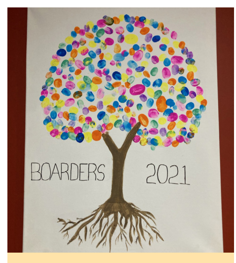
Our Reconciliation Week artwork from last year is now proudly on display