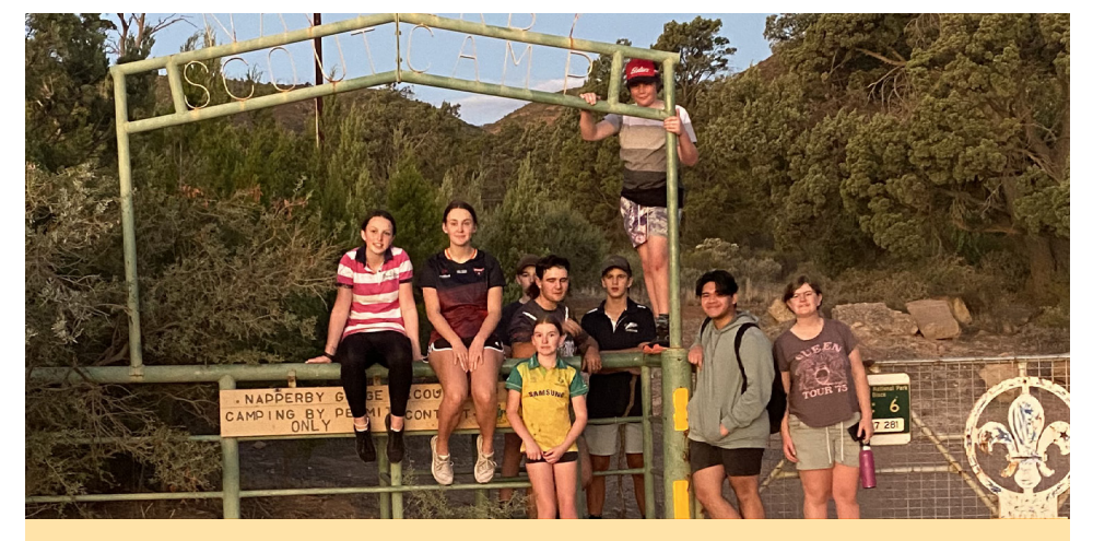
Enjoying a hike after school at Napperby Scout Camp