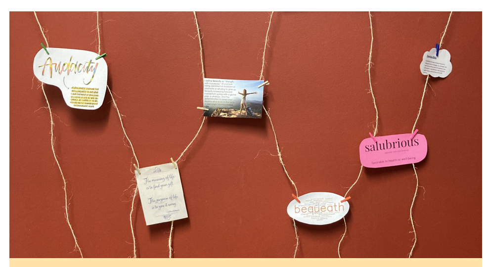
Our Boarders have been expanding their vocabulary with the new 'Word Wall' featuring words such as audacity, serendipity and tenacity