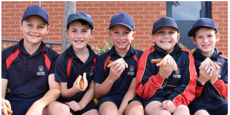
FEAST DAY: The College paused in prayer and for a sausage to celebrate the Feast Day of Our Lady Help of Christians