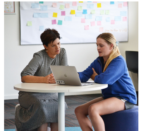
STUDY HUB: The former Bosco Library has been transformed into a Student Hub, a new wellbeing initiative at the College