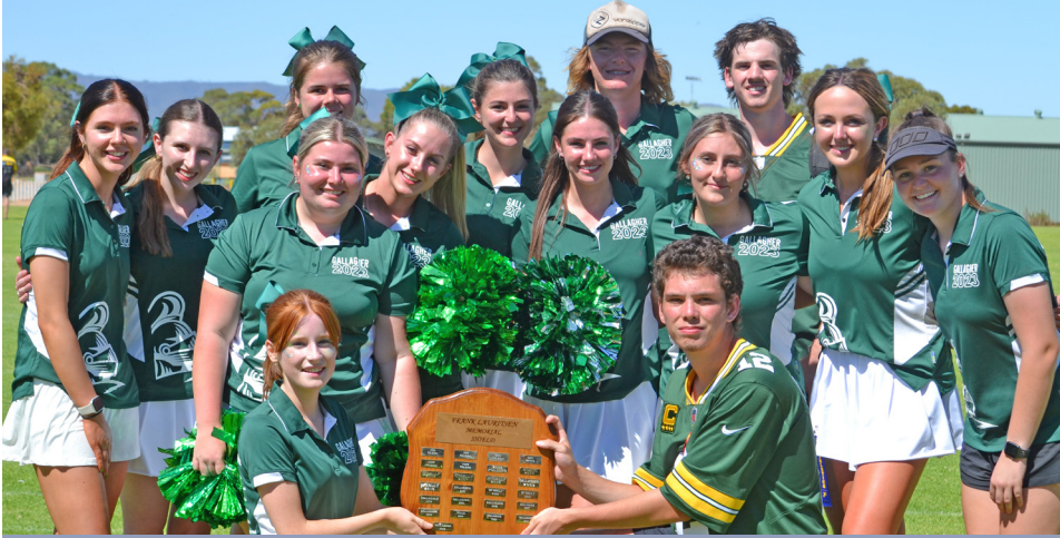
SPORTS DAY: It's green for the win again! Gallagher were winners of our 2023 Bosco Athletics Day, pictured are our Gallagher Class of 2023