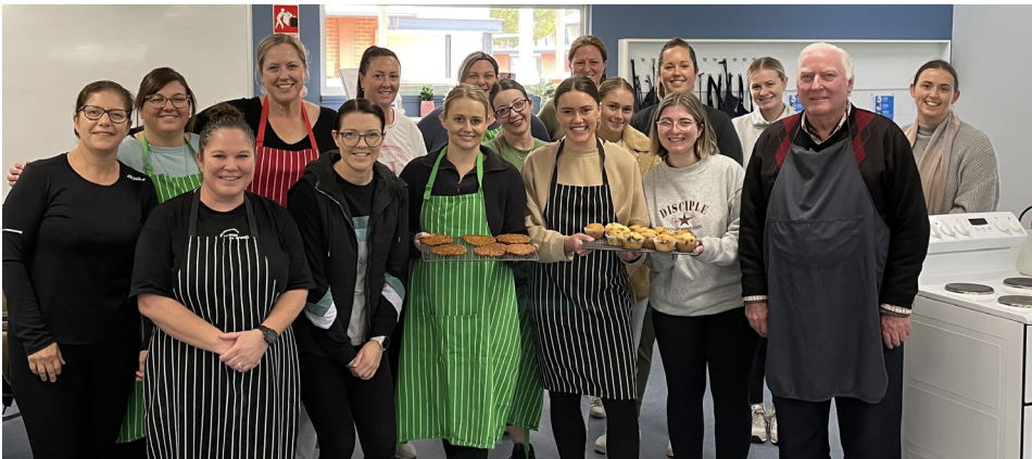
STAFF RETREAT: Part of this year's Staff Retreat included community service. Staff volunteered in for a number of activities to benefit the community- assisting at Goods at Gertrude and Vinnies, tree planting, cooking food for Fred's Van, planking (picking up rubbish while walking) and cleaning up areas of the school