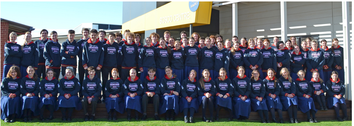
YEAR 12: The Class of 2023 with their commemorative 'Seniors' jumpers