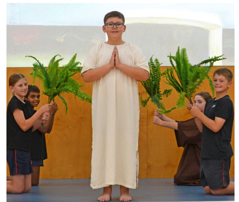
EASTER: The tradition of the annual Easter Reenactment continues with Year 5s successfully sharing the Easter story with our school community