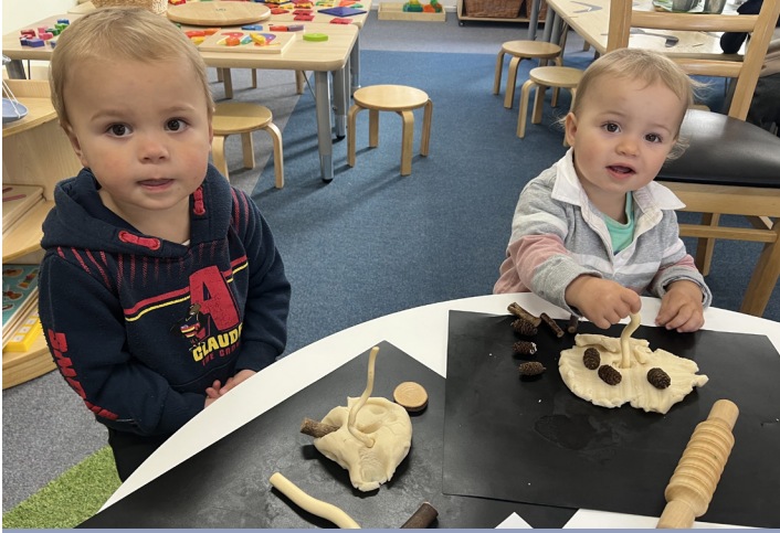
MINI MARK'S: This year we have introduced Mini Mark's as a weekly playgroup for local families