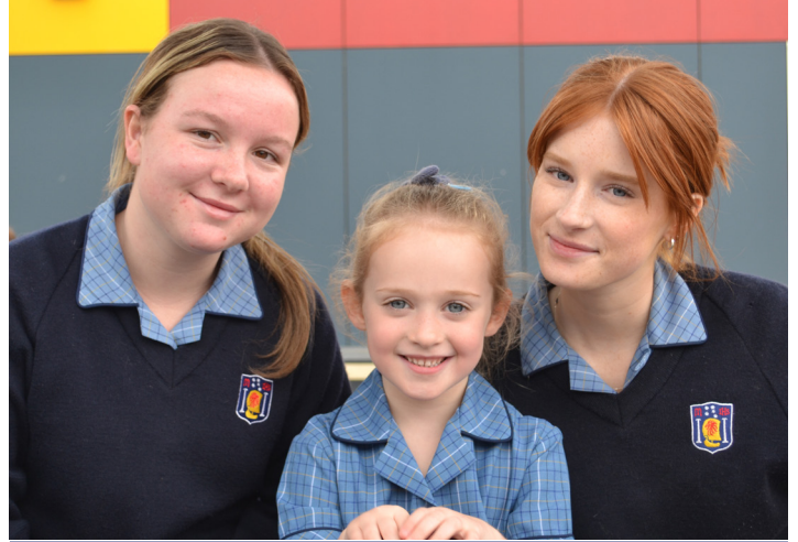
BUDDIES: Year 12s and Receptions have formed bonds in a new Buddy program initiative