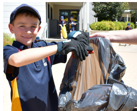
Bentley helping to 'clean up' at Benedict.