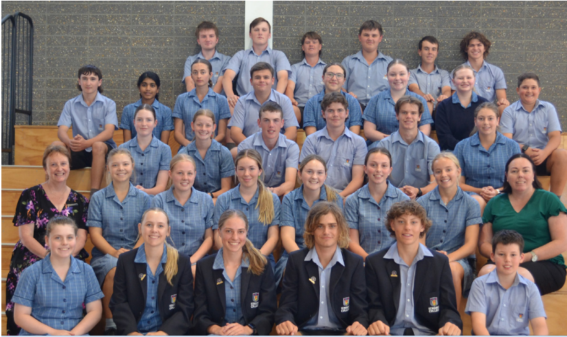
LEADERS > Our Bosco Student Leaders were officially commissioned.