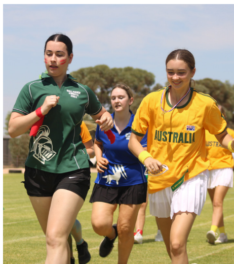
Year 12s competing in the 400m.