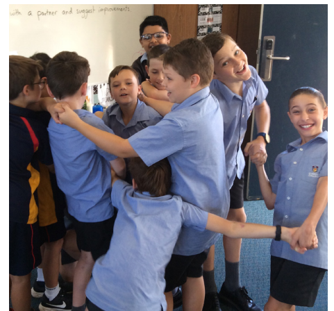
MORNING CIRCLE > Year 5s were getting the positive energy flowing trying to achieve a 'human knot' during Morning Circle.