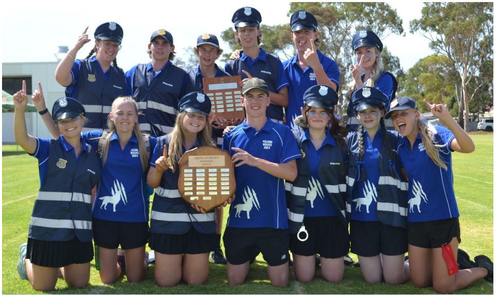
Our Year 12 students from Polding who were winners at Bosco Athletics Day.