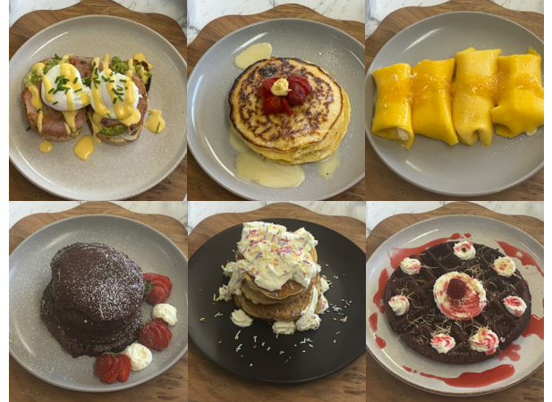
FOOD + HOSPITALITY > Year 11 students recently completed their Café Brunch unit, planning, preparing and presenting a suitable dish to be served in a café for brunch.