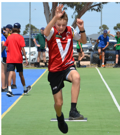
Harvey takes a leap.