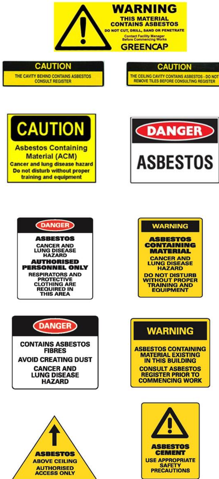
Figure 7.4. Asbestos awareness and signage examples